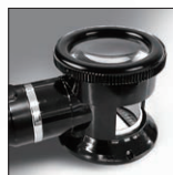
Intake of natural light for bright view