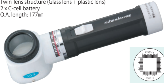
Built-in 20mm scale